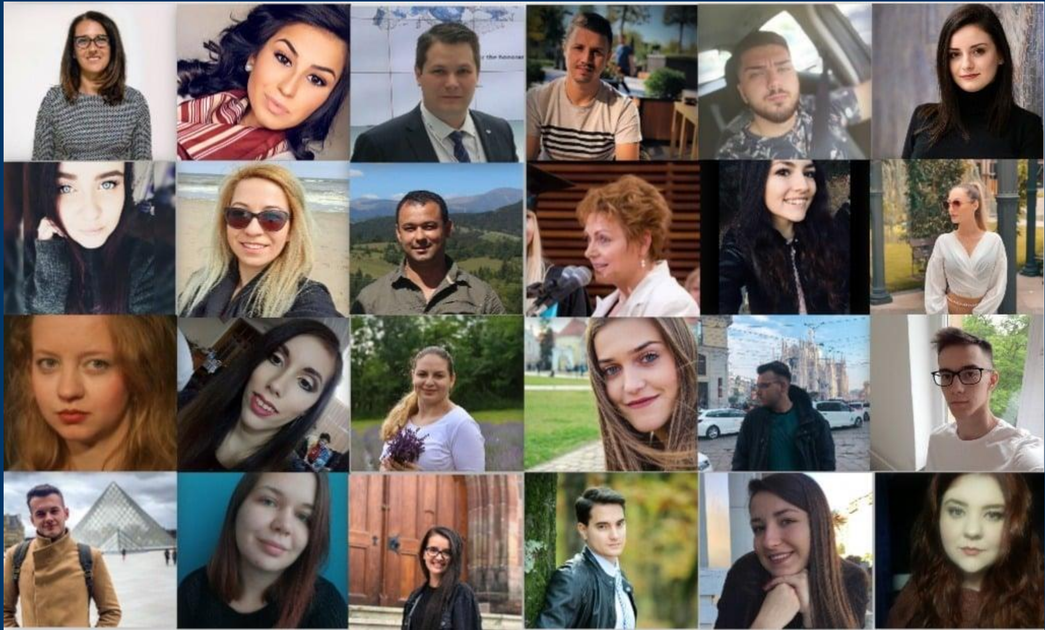
IHRM School Team 2020