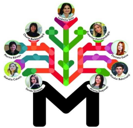
Discover the Moldovan Team